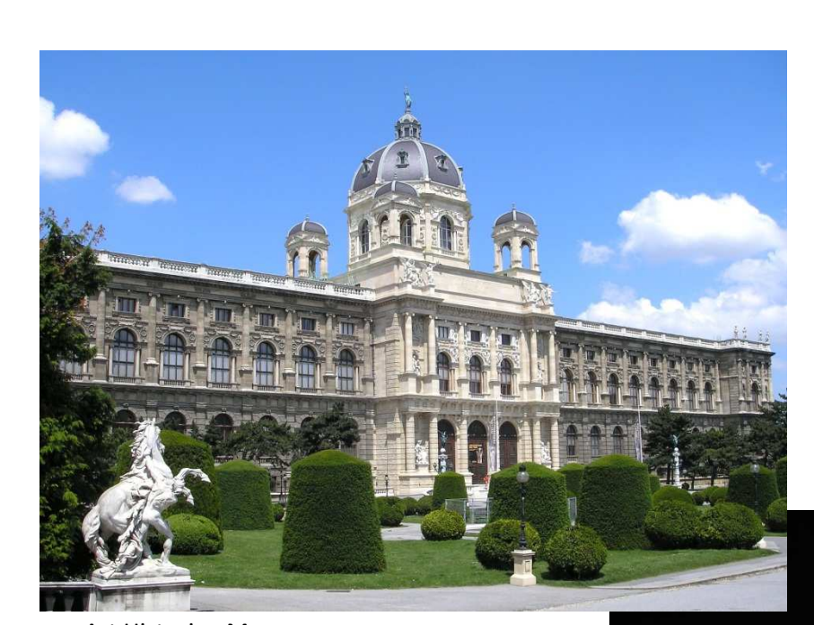
Art Historian Museum