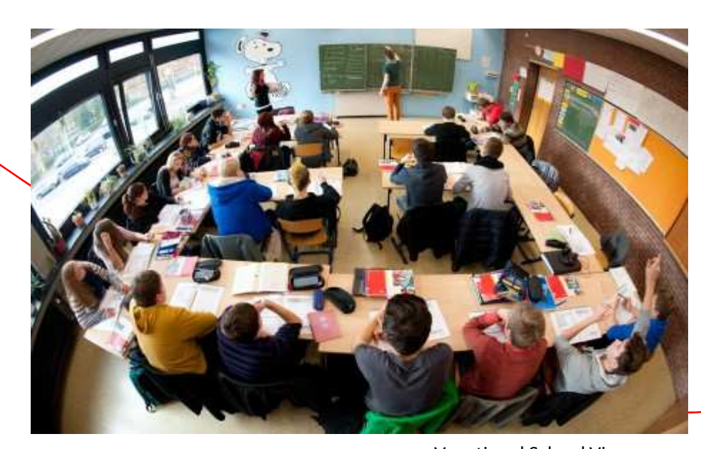
Vocational School Vienna