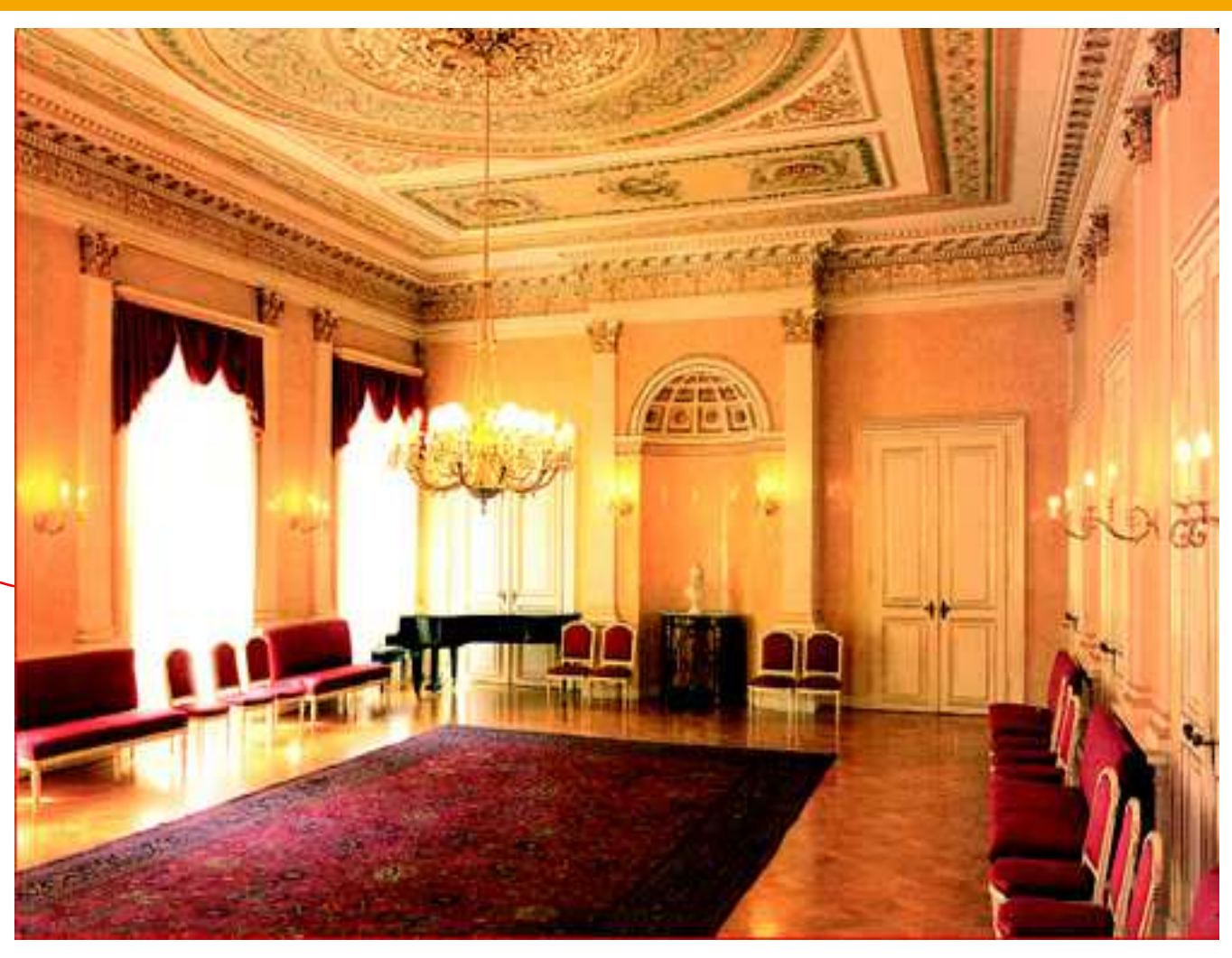
Audienzsaal Education Ministry Palais Starhemberg