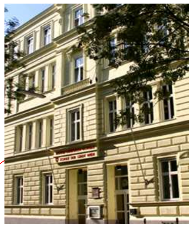
Obligatory School in Vienna