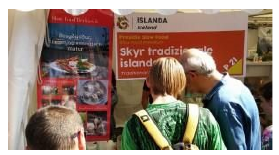
Guests at the SlowFood event

The town festival strengthens local identity but it is also important for the local identity to celebrate the different origins of its inhabitants, to see that the little village of Höfn is a cosmopolitan village with connections to different corners of the world.