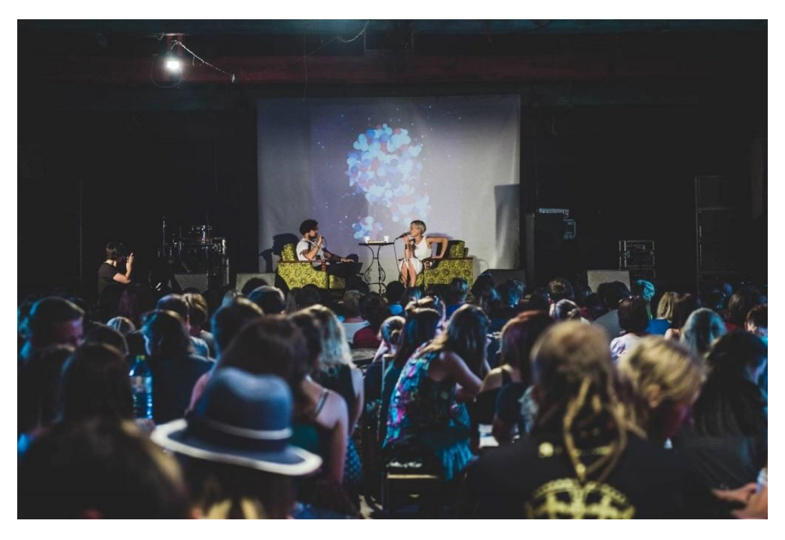
One of the Slot Art Festival events.

The festival's history goes back to the 80's and the counter-culture of that turbulent time. In 2001 the Slot Art festival was moved to Lubiąż – an exceptional location – within the walls of the Baroque, Cistercian monastery-palace complex in Lower Silesia.