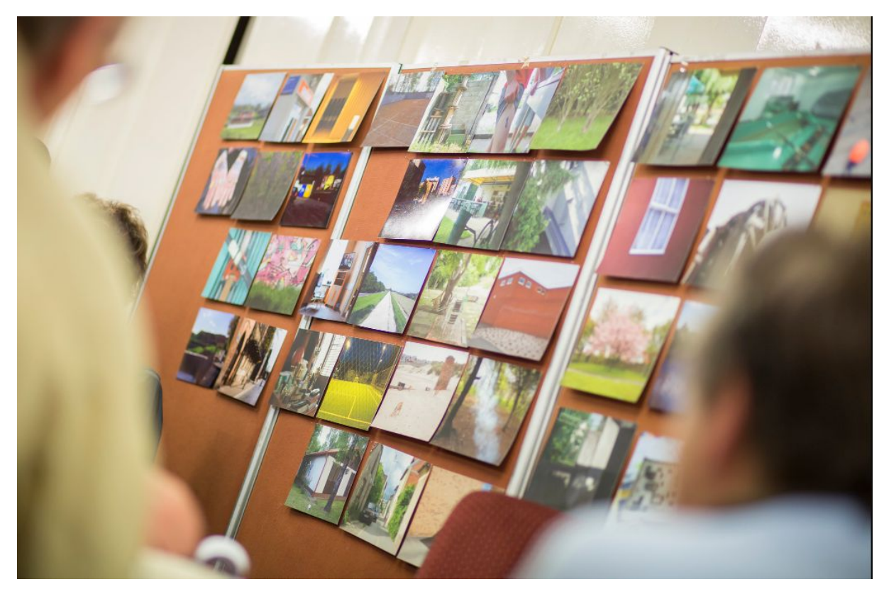
Corners of Europe in East Durham

Using artists in groups and organizations from different backgrounds and countries allows as well passing over the language barriers that could hinder an inter-European project.