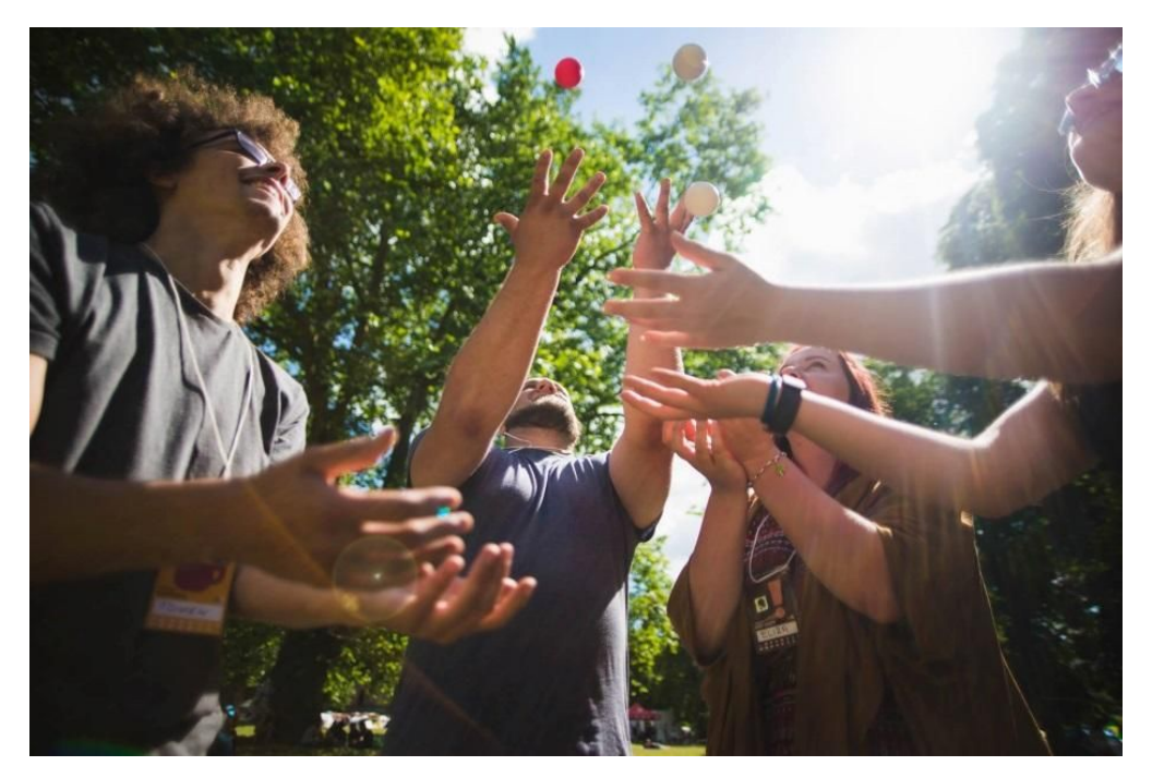
One of the Slot Art Festival events.

The Festival, as a grassroots initiative organised by volunteers, takes place every year for 25 years now, growing and developing.