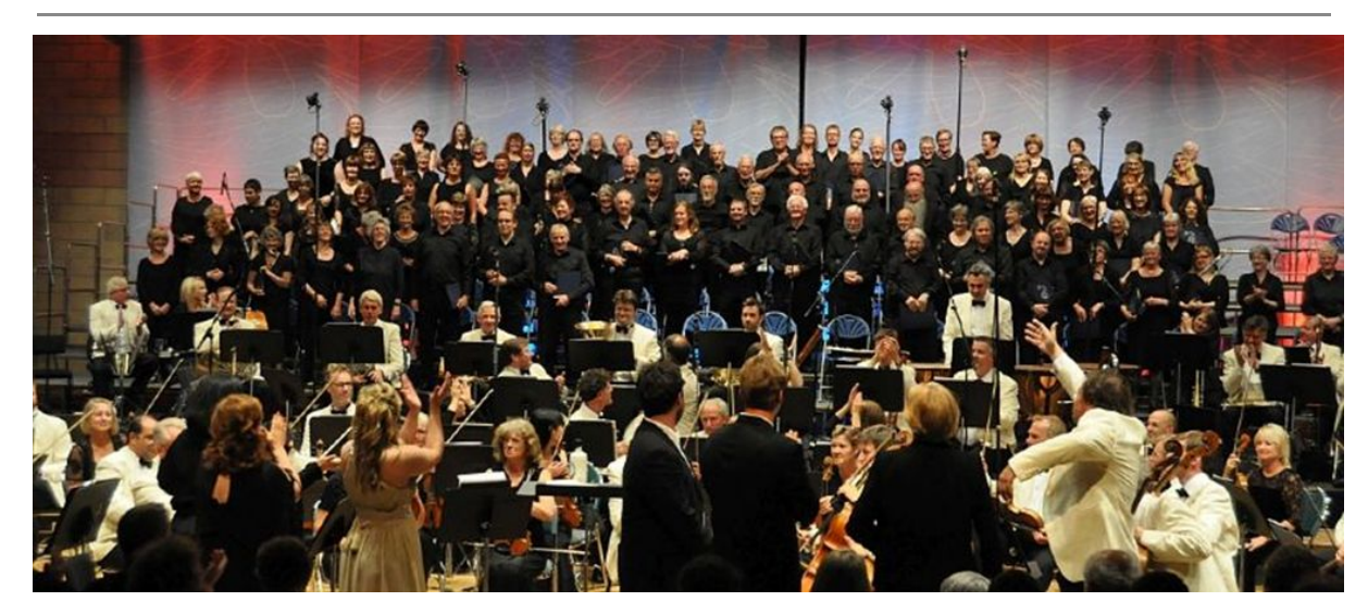
Orchestra performance at St Magnus festival

The unique combination of world-class performance, community participation of the highest quality and the magic of Orkney at midsummer attracts audiences from throughout Britain and further afield: many return year after year. Though musical events are at the heart of the artistic programme, the Festival also encompasses drama, dance, literature and the visual arts.