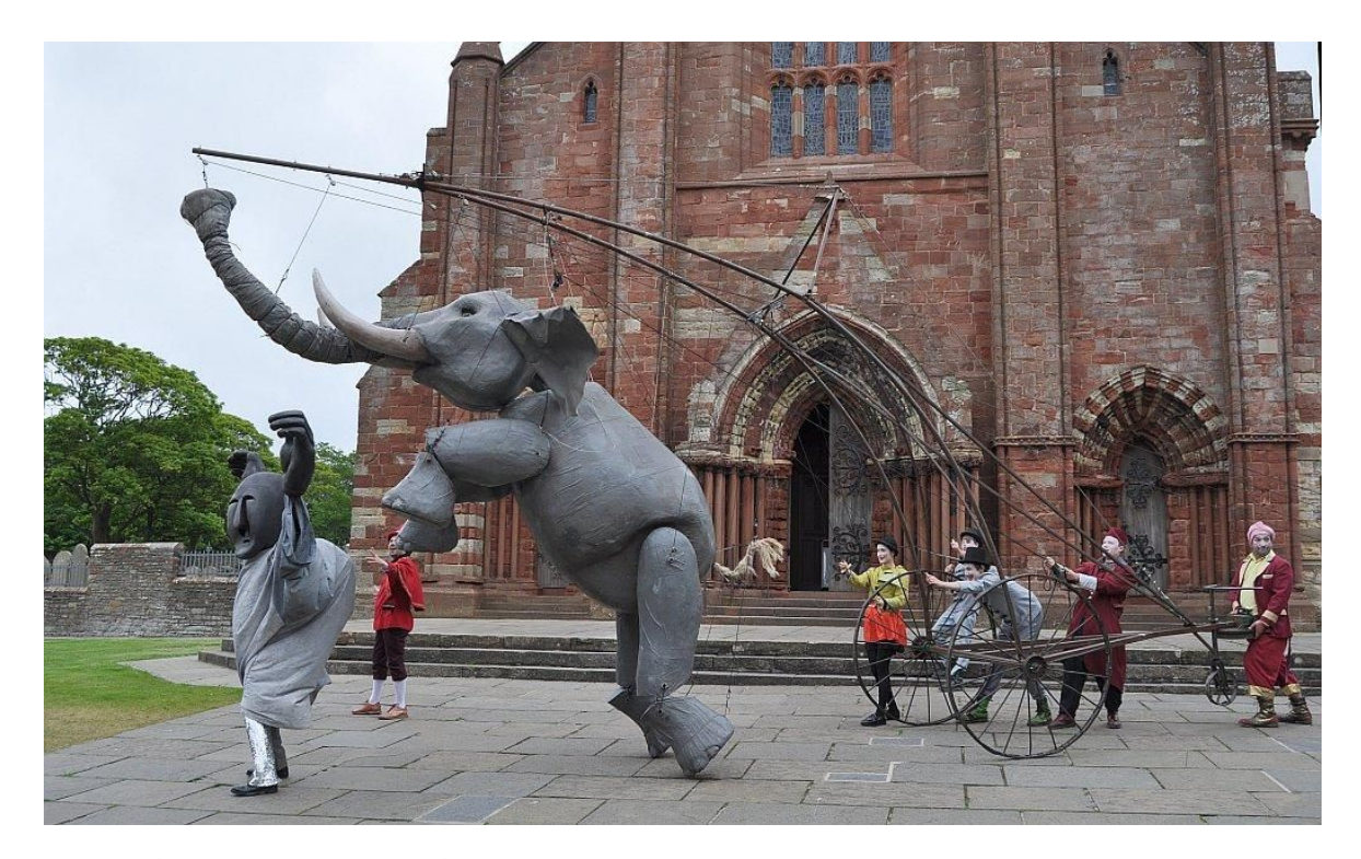
Event at the St Magnus Festival, 2016

Through education and community projects the Festival has built up active participation by adults and children from all parts of Orkney, often devised in collaboration with visiting orchestras, ensembles and artists. Typically over 400 members of the local community perform at the Festival each year.