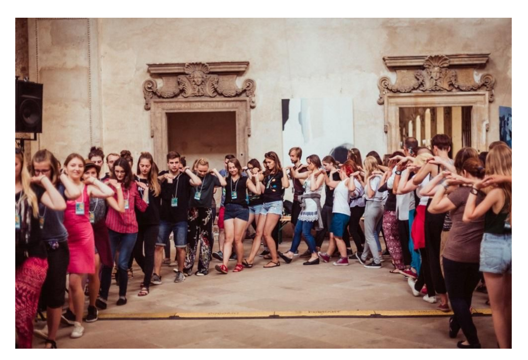
One of the Slot Art Festival events.

Because SLOT is more of a movement than an organization. Local creative centers are located all around Poland where groups of people cooperate with SLOT. Usually these people are connected to SLOT and realize their ideas on a local level with SLOT days, film discussion groups, concerts and parties.