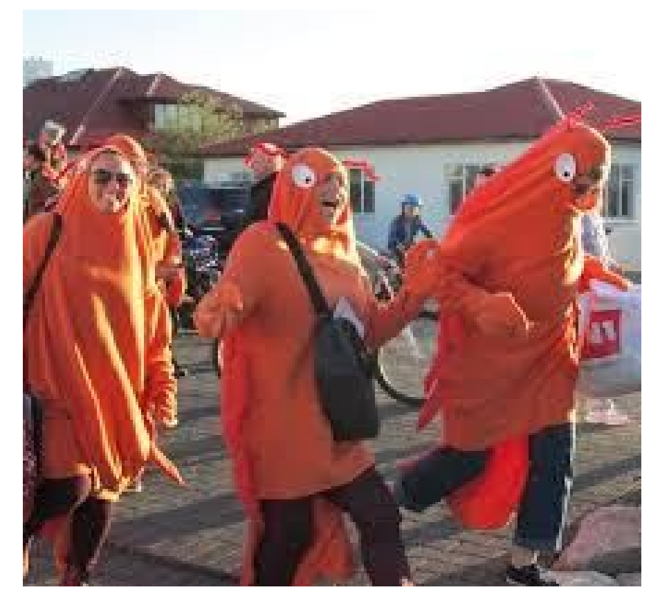
Locals dressing up at the Lobster festival parade

The women's choir invites guests to enjoy a musical event where music from a different country is in focus every year and the food they offer reflects on that. One year they were focusing on Sweden and the food they offered was typically Swedish, one year it was the USA and the next Germany. Organizations and individuals participate in offering a variety of activity for every age group and the family as a whole. Young musicians are given an opportunity to play for the guests and form bands, participate in a parade or play in a venue.