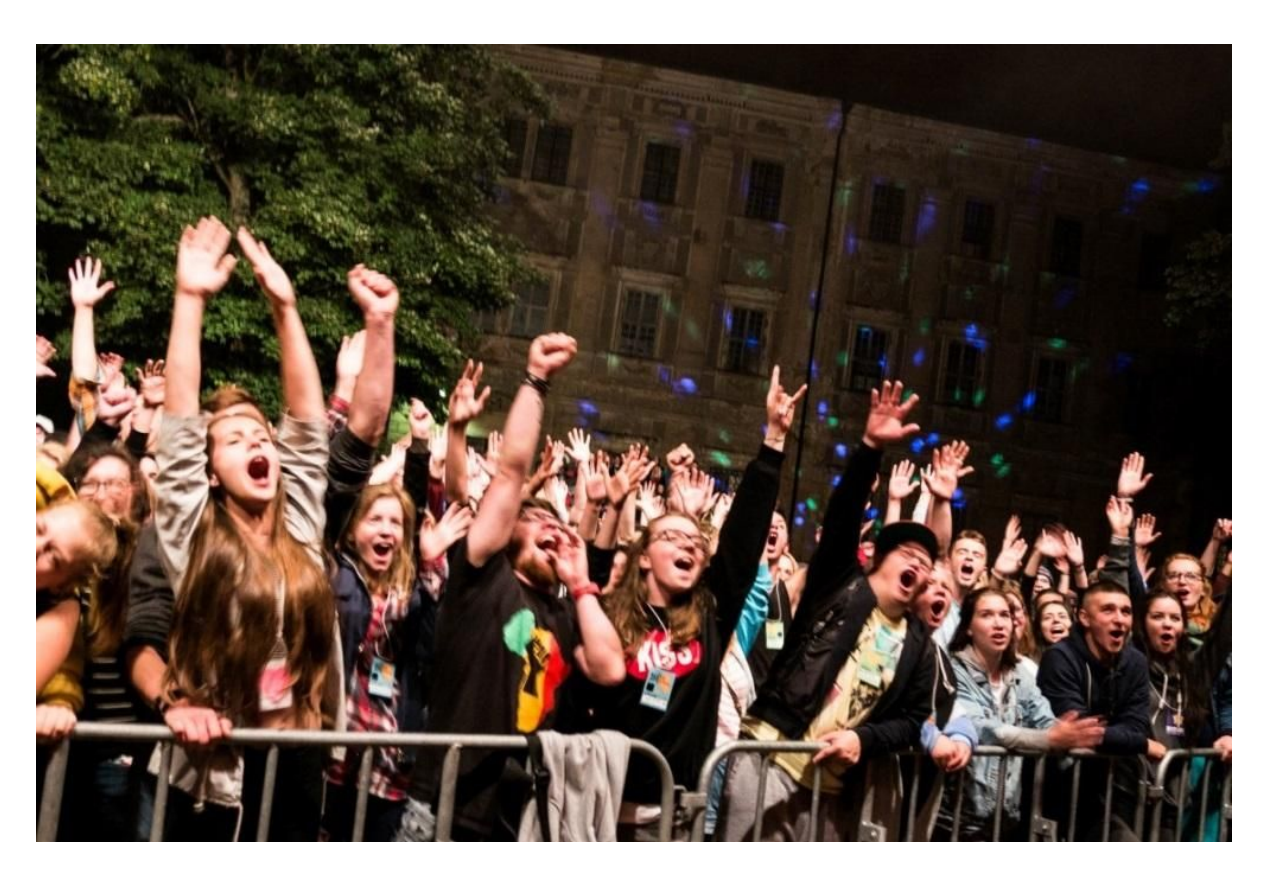
One of the Slot Art Festival events.

There's not a clear border between organizers and participants. SLOT is constructed so as to allow involvement and influence on its form by those who want to join in. If someone has a good idea for something interesting and valuable to do for others there is a place for it at SLOT.