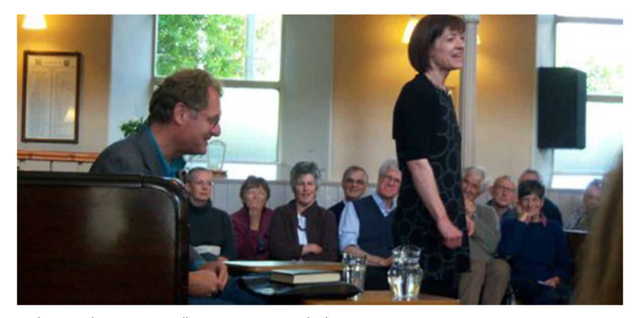
Andrew Motion poetry reading, St Magnus Festival 2009

Orkney Arts Forum<sup>8</sup> supports the development of arts and culture within Orkney. The forum consists of voluntary representatives from art forms including music, visual arts, literature, drama, dance, storytelling, craft, architecture and new media, and film as well as key organisations and community groups. The forum meets quarterly to discuss the priorities for the arts in Orkney and acts as a consultation group for the arts development service within Orkney Islands Council.