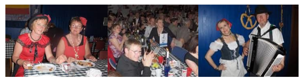
From events with International dance groups

International dance groups were invited to stay for 2-3 weeks at Höfn and other communities during the winter time, when f. ex. in Höfn tourist had not arrived. The dancers had a training facility that the municipality fixed for them and in return they were running seminars for kids and youngsters in the area.