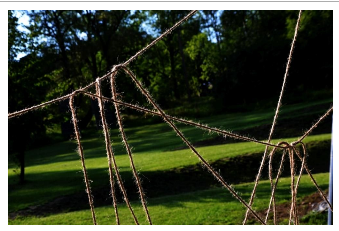
The Bridge Builders Village

Because in 2011 there was an International Centre for Dialogue founded, located in the Krasnoruda Manor. Its activity focus on the multicultural legacy of the Polish-Lithuanian Commonwealth and its new meaning in the unified Europe.