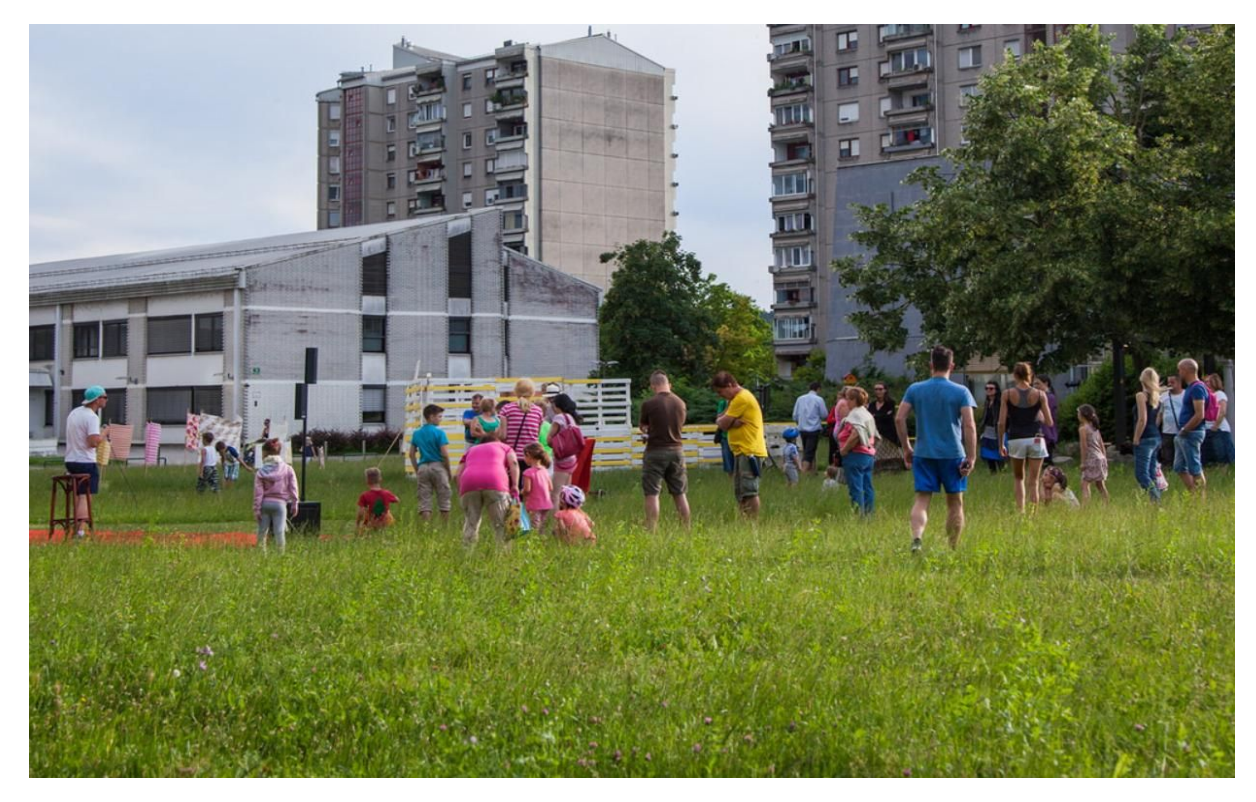
In Between in Ljubljana

Another example is the artistic platform "In Between". Between 2014 and 2017, the project has moved to another city every 15 days. Its goals are to "listen and share personal and communal stories through memories and exploring every day's life to re-create social memory together and to understand what is important to people". Through the platform website, they show the material they have collected during their 15 days long stay. The project creates a dialogue between different places, and a new relationship between different populations.