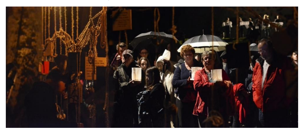
Mystery of the Bridge

The Borderland Foundation has been just awarded European Cultural Foundation Princess Margriet Award for Culture 2018<sup>12</sup> – as the first Polish organisation. The 10th anniversary of the Award had a theme 'Courageous Citizens'- sought to highlight and celebrate those remarkable and courageous agents of cultural change who inspire to create lasting social alternatives based on an inclusive vision of Europe.