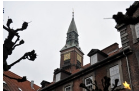
City Hall tower seen from Vartov's courtyard

Vartov is an historic and beautiful building with Copenhagen City Hall as its closest neighbour.