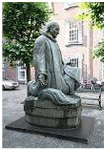
Statue of Grundtvig