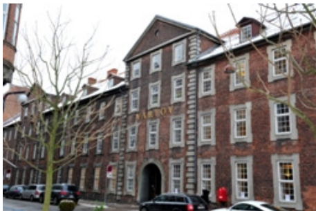
Entrance to Vartov